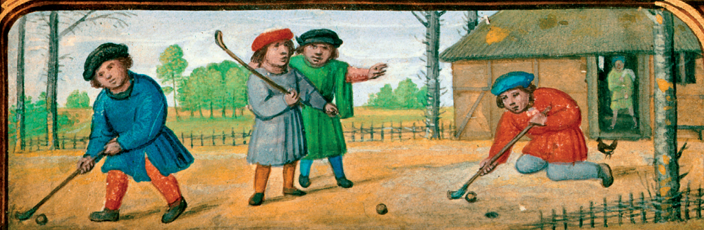
Book of Hours (c1520) – September (c1520), illustrated by Simon Bening of Bruges (The British Library)

AL Septē. 12 f Oct. marie ber: 1 g xxx: lūa xxx 16 f Egion: 9 b 5 g a 13 b Cleuthen 17 d Vig. 2 c 6 e Mathe: d f Anna. 10 e 14 g. f Nat. m: 3 a 18 g Adriam; b firmine. 7 a n c b d Cosme rda. 15 c hugois 8 f Michaelis 4 d g. Ieronimi e Exalt'one? 26 pbū.