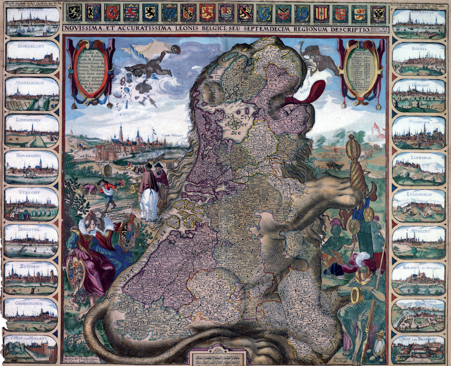
Leo Belgicus - Novissima et Accuratissima Leonis Belgici (1609), by Claes Janszoon Visscher (Historisch Museum Rotterdam)